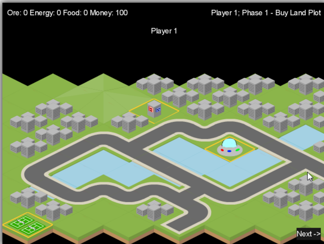
The game map.

The player is given the view of the map, the map can be dragged with the mouse and individual plots can be clicked on. When a plot is clicked you are given the option to buy that plot by pressing the button that appears. To buy another plot click anywhere except that button then click on a new plot to buy to bring up the button. When you are done press the next phase button to move to phase 2.